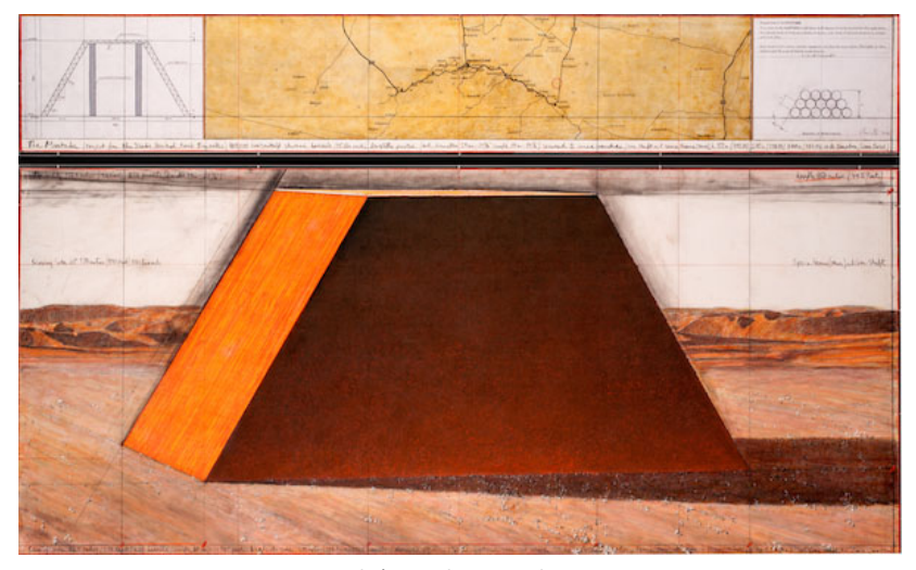
Christo, The Mastaba.

Over The River is currently on the cusp of being given permission to be realized in the Arkansas River, as the Obama administration is battling with local authorities in an effort to make the project happen. If it does, in summer 2017 rowers will be able to raft through the rapids, underneath the swathes of fabric. These drawings give a striking impression of what the realized work would look and feel like, showing the scale of the work through aerial drawings and annotated photographs, with samples of the iridescent fabric.