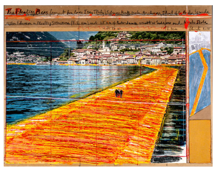
Christo, The Floating Piers (2014).

The three projects detailed in these works on paper range from the realized and the ambitious to the near impossible. For example, Floating Piers has been in its conceptual stage since the early 1970s, and was shelved after failing to get permission in both the Rio de la Plata in Argentina and Tokyo Bay.