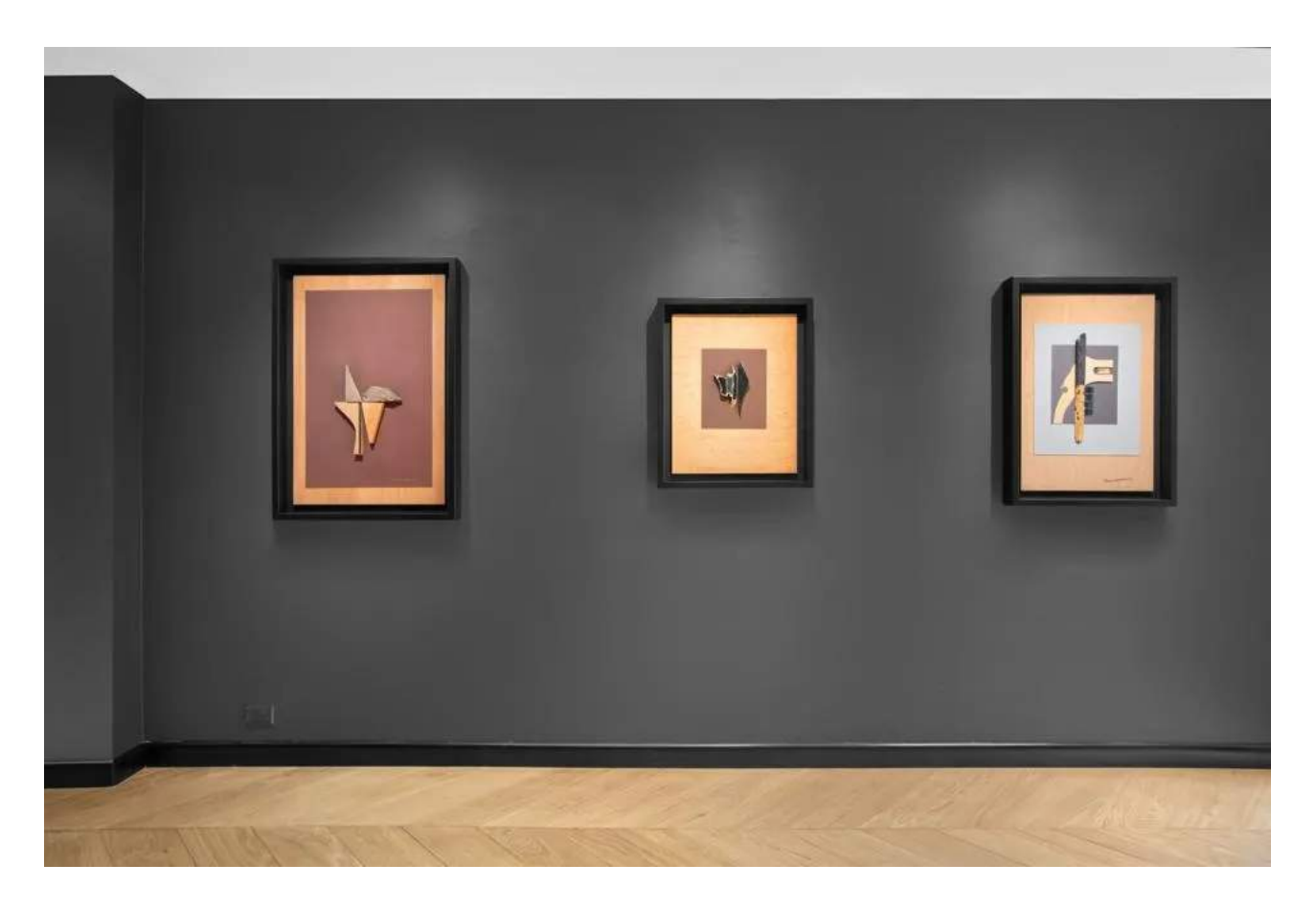
Installation view of the exhibition Louise Nevelson - The Way I Think Is Collage