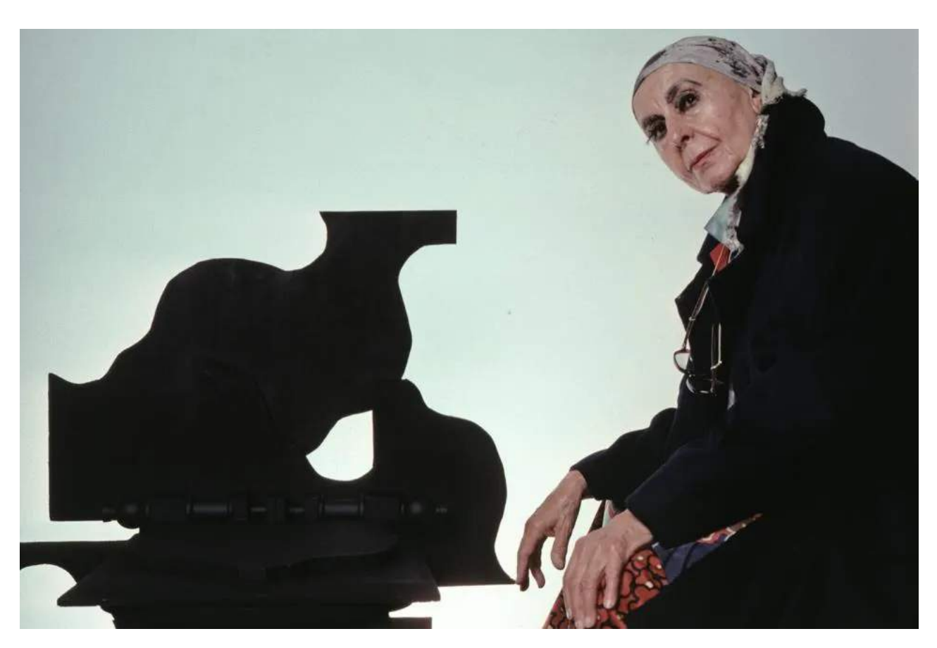
Sculptor Louise Nevelson photographed in her New York City studio in 1983.

A solo exhibition featuring the artist's work called Louise Nevelson - The Way I Think is Collage, runs until November 29 at Galerie Gmurzynska in New York City. It features untitled wall works from the 1960s through the 1980s, which are made of cardboard, paint, metal, and wood. The gallery will also feature a piece from "The Dawn Series," which is traveling from Switzerland, and remains one of the artist's most monumental sculptures.