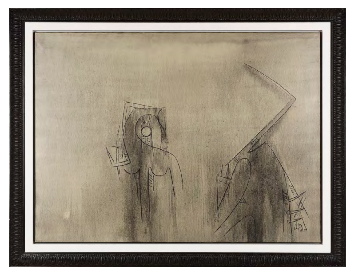
Wifredo Lam, Figures grises (Composition fantastique), 1974