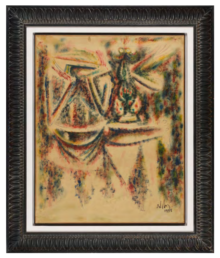
Wifredo Lam, Deux personnages IV, 1945

Lam's works, especially from the 1940s, today are highly sought after since they constitute the highlights of the definitive collections of Lam such as at the Centre Pompidou, Paris; the National Museum in Havana; and the Museum of Modern Art, New York.