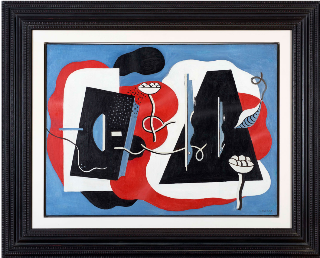
Fernand Léger "Nature morte au compas", oil on canvas, 1929

GALERIE GMURZYNSKA will feature 3 highlighted sections at Art Basel: