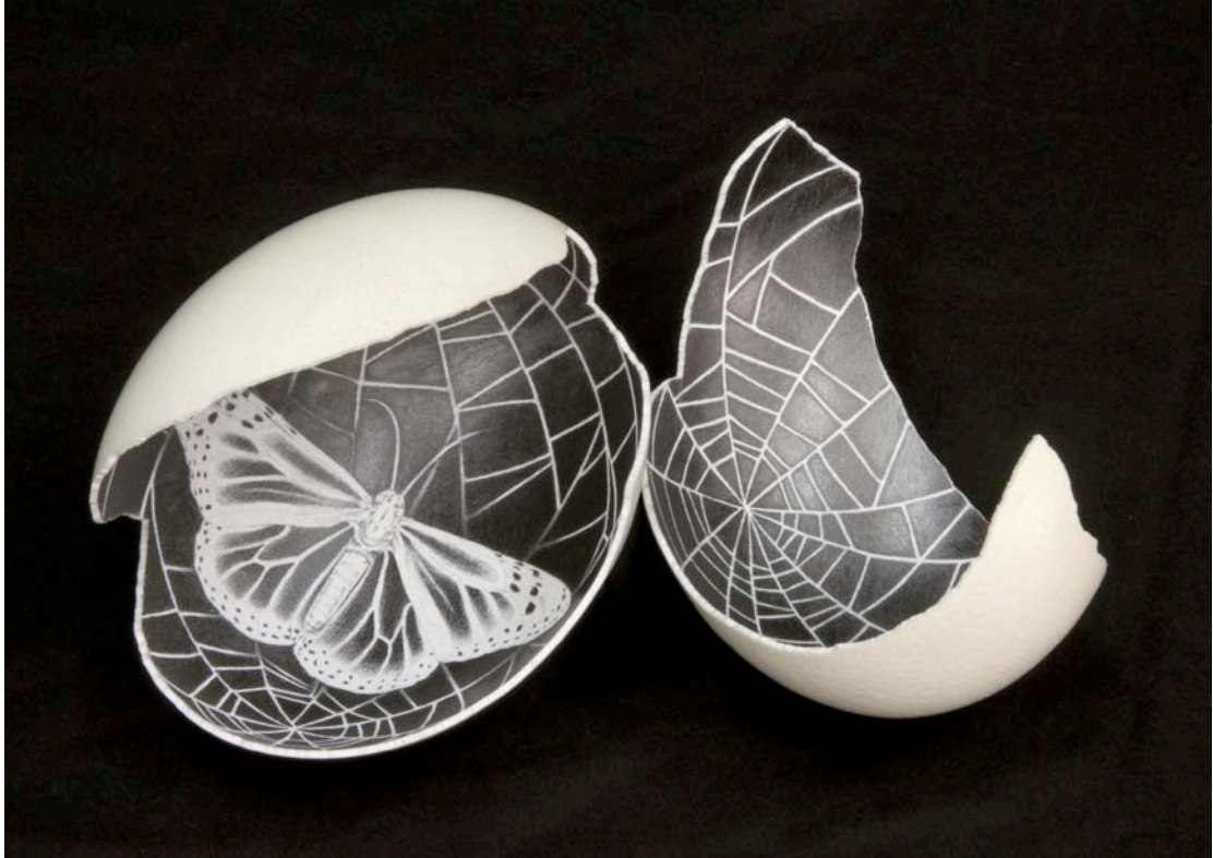
SCOTT CAMPBELL Untitled (Black with White Butterfly) 2011 Graphite on ostrich egg Dimensions variable

galerie gmurzynska 20th century masters since 1965 www.gmurzynska.com