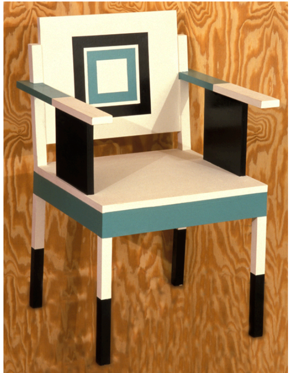
Nikolai Suetin. Easy Chair. 1920s/2001