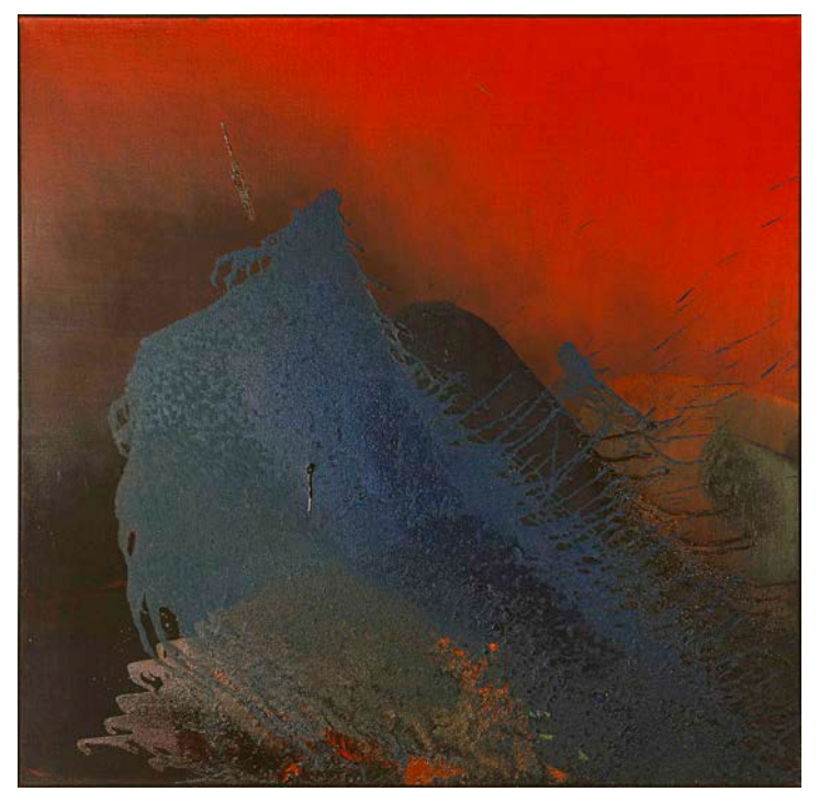
Otto Piene, Waves, 1975

"In sum, my goal is twofold: first of all, to register the trace of human sentimentality in present-day civilization; secondly, to register the trace of fire which has engendered this very same civilization. And this because the void has always been my constant preoccupation; and I hold that in the heart of the void as well as in the heart of man, fires are burning. Traces of fire..." Yves Klein