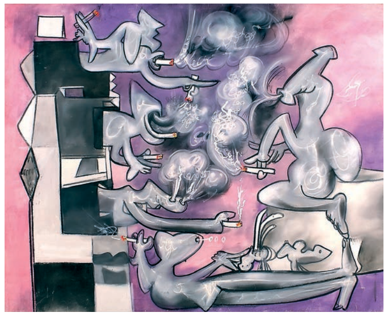
Roberto Matta, Les Fumoïsses, 1973