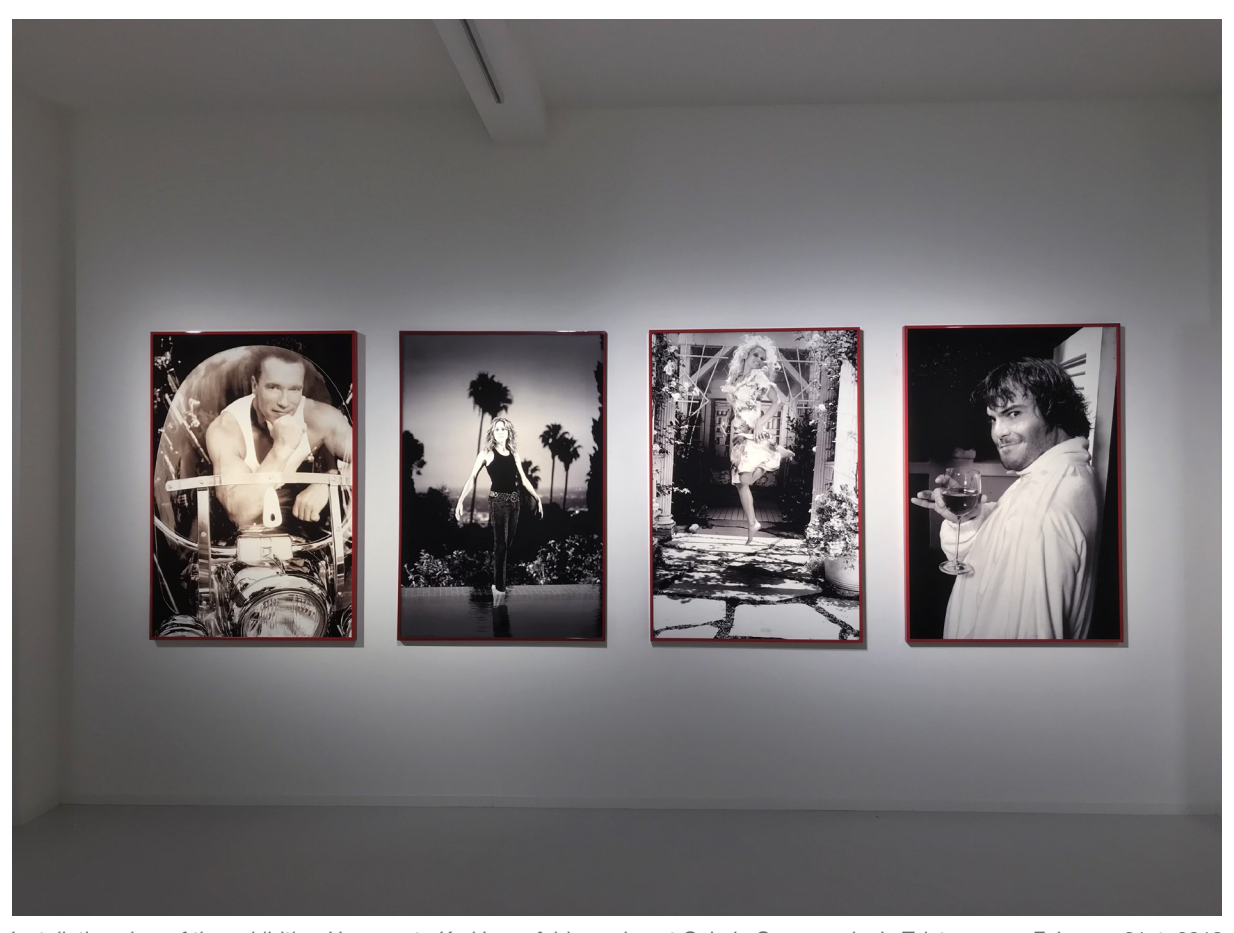
Installation view of the exhibition Homage to Karl Lagerfeld opening at Galerie Gmurzynska in Talstrasse on February 21st, 2019