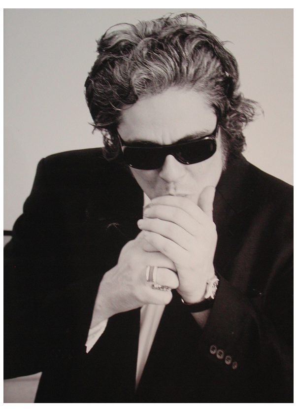
Karl Lagerfeld, Benicio del Toro (Hollywood Stars), 2002