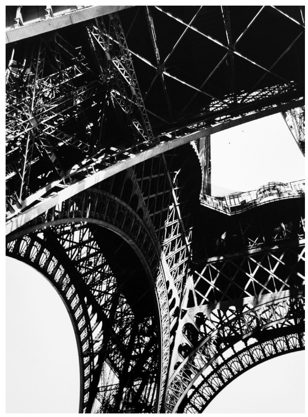
Karl Lagerfeld, Series Eiffel-Turm, 2010