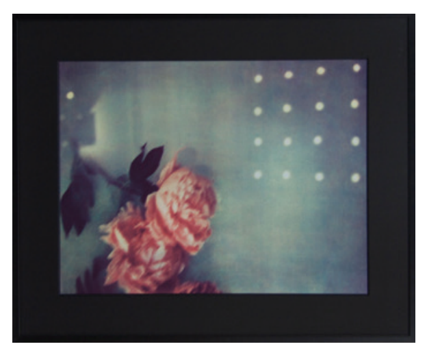
Karl Lagerfeld, Floating Flowers, 2011