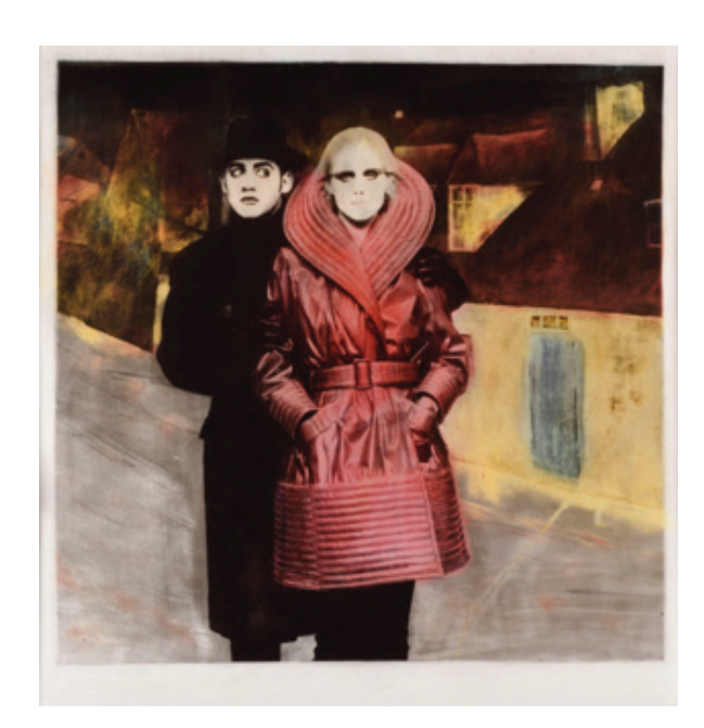
Karl Lagerfeld, Lüstern aber schüchtern , From the series Hommage an Lyonel Feininger , 1997