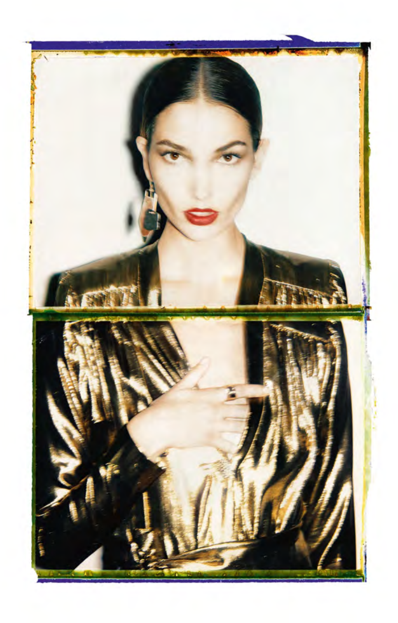
Lily Aldridge