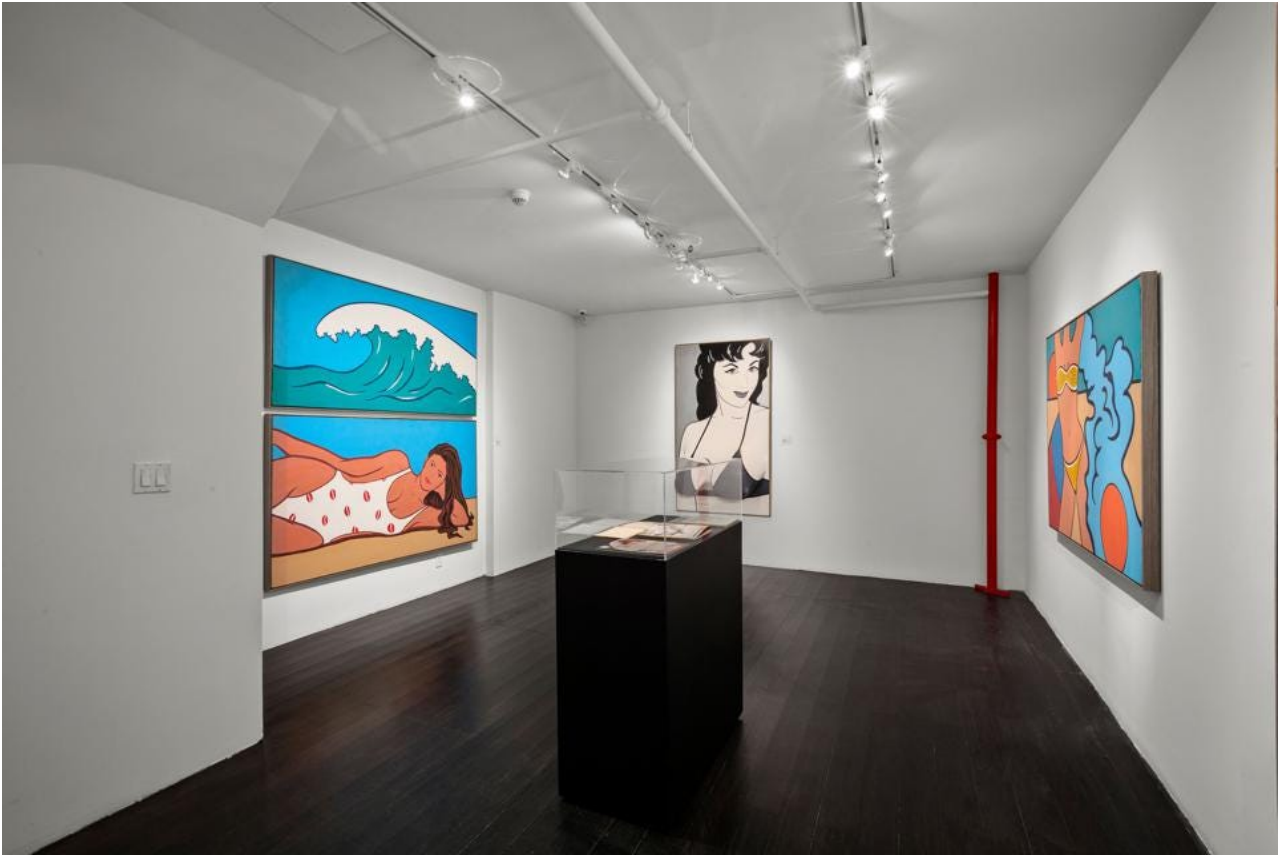
Installation. view of Marjorie Strider 'Marjorie Strider: Girls, girls, girls!'