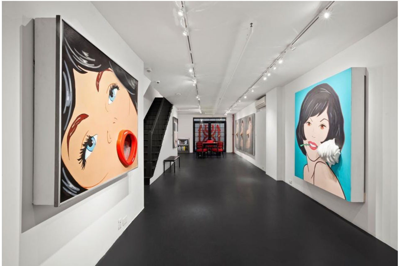
Installation. view of Marjorie Strider 'Marjorie Strider: Girls, girls, girls!,' On left wall: 'Welcome' (1963) Signed and dated 1964 Acrylic on masonite with wood build out 48 x 54 x 9 in 121.9 x 137.2 x 22.9 cm

Welcome , another work from 1963, further bends the boundary between painting and sculpture, as we're drawn into the mouth, agape and protruding from the canvas. Meticulous details, from the white glints of her blue eyes to the starlet shine of her cherry lipstick and the wispy waves in her hair, compete for our attention and amplify the waggish title, which forces us to confront a woman's reversal of the male gaze.