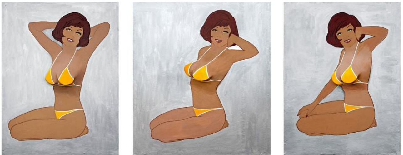
Marjorie Strider 'Triptych II (Beach Girl)' (1963) on Masonite and wood panel Panels: 1/3 69 x 51.5 5 x 2 in 2/3 69 x 51.5 x 2 in 3/3 69 x 62 x 2" in

A young woman with a shag bob haircut wearing a yellow string bikini with white piping sits in seiza, posing playfully for the viewer. Elbows raised to accentuate her feminine form, her ample breasts protrude from the three canvases, as sculpture erupts from the painting.