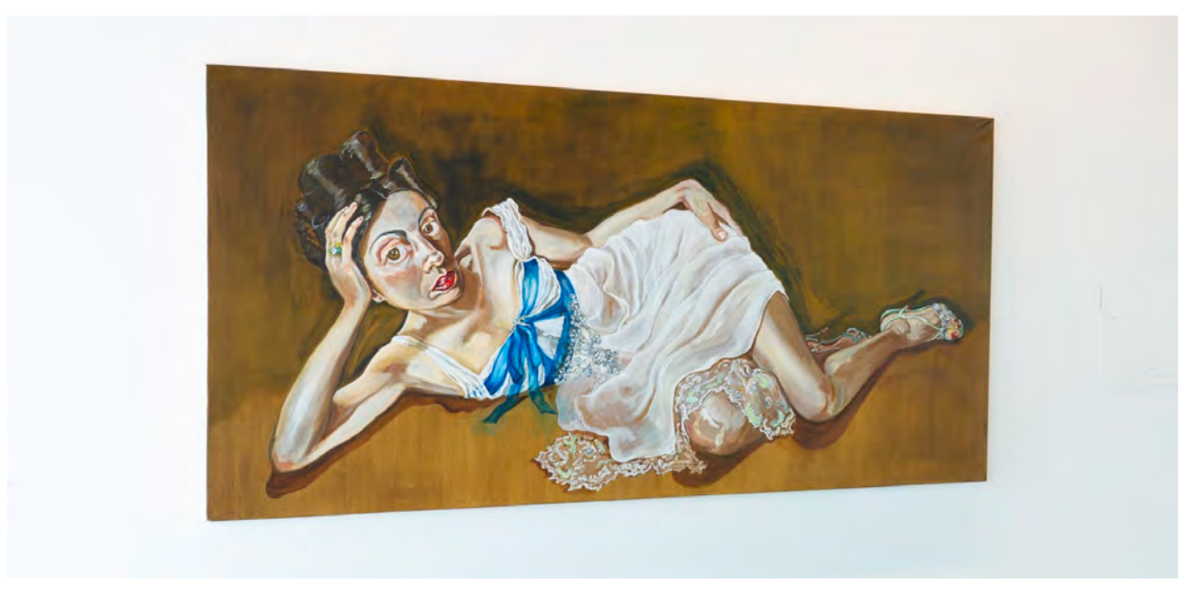
"Urgency of the Worst," 2009

and I wanted to portray it. It was around the time her husband passed away. She became very emotional while she sat for me, she had tears in her eyes when I played music—maybe it reminded her of someone—and she asked if she could have the playlist. That happens a lot—you're off your guard, so whatever emotion is within you is going to come out, and that's what I want to paint."