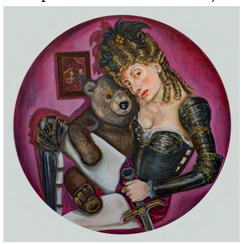
"The Impossible Gender Frontiers," 2022

"This painting is about a relationship. How close can you be to someone else? How much distance do you need? I was very close to that dog—it was my ex husband's—and I was trying to make a portrait of my relationship with him through the dog. It's about our struggle to connect. I'm kind of a prude in life—I never did any naked shoots during my modeling career—but when I'm naked on the canvas I don't feel like it's me, so I'm not self conscious. Because I'm nude in the painting, suddenly it seems like the dog is also nude, although of course dogs always are. The painting creates nudity. "