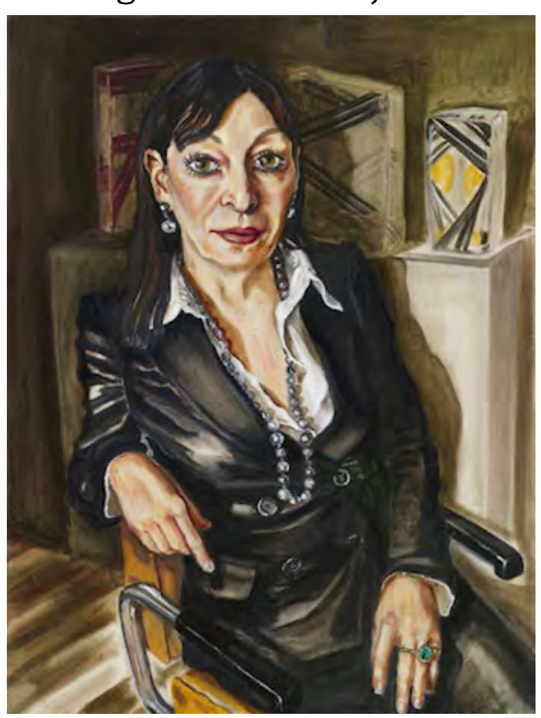
"Angelica Huston," 2009

"I wanted to explore the line between feminine and masculine. What is strength, what is vulnerability? What attracts, and what pushes away? So she's wearing a blonde wig—as a kid I used to always wear a blonde wig. I thought if I was blonde, I'd be more attractive. I was half Asian with dark hair—forget it. She's holding the bear, showing her vulnerability, but also she's in all that armor, she's on guard. But the explanation, it comes after. All I knew was that I wanted to paint that wig, and then I figured out why."