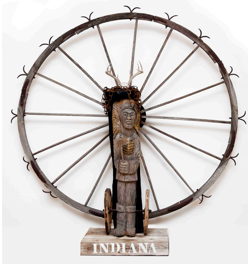
Robert Indiana, Indiana , 1979

Galerie Gmurzynska is pleased to return to Art Basel (BOOTH G3) for the 49th consecutive year. Building upon its reputation for staging special exhibitions at the fair, the gallery will present two exclusively curated Cabinet Exhibitions ( Robert Indiana and Matta/Duchamp ) alongside a selection of Classic Modern as well as Post-War works, including three major paintings by Pablo Picasso and a large scale canvas by Wifredo Lam , whose retrospective runs parallel at Galerie Gmurzynska's Zurich premises. To round out the selection is an outstanding Ed Ruscha painting, which in turn alludes to the influence of Robert Indiana on artists working with words.