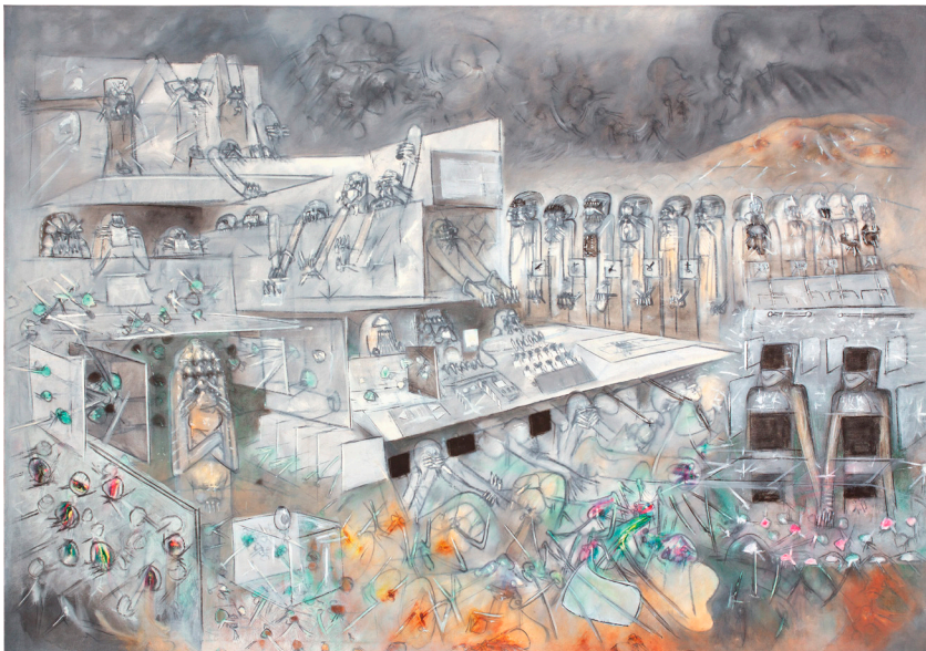
Roberto Matta, Les Roses sont belles , 1951