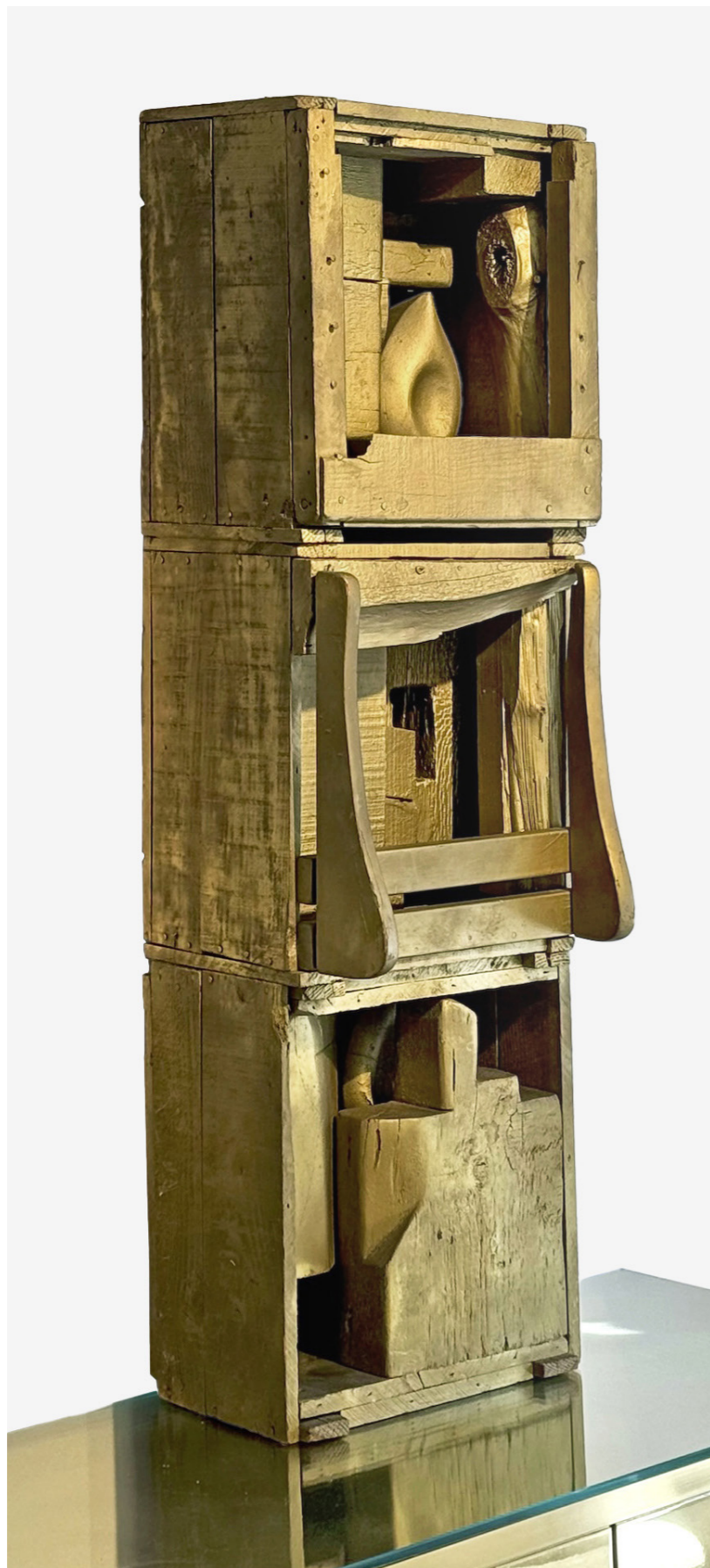
Louise Nevelson Royal Winds 1960-1961