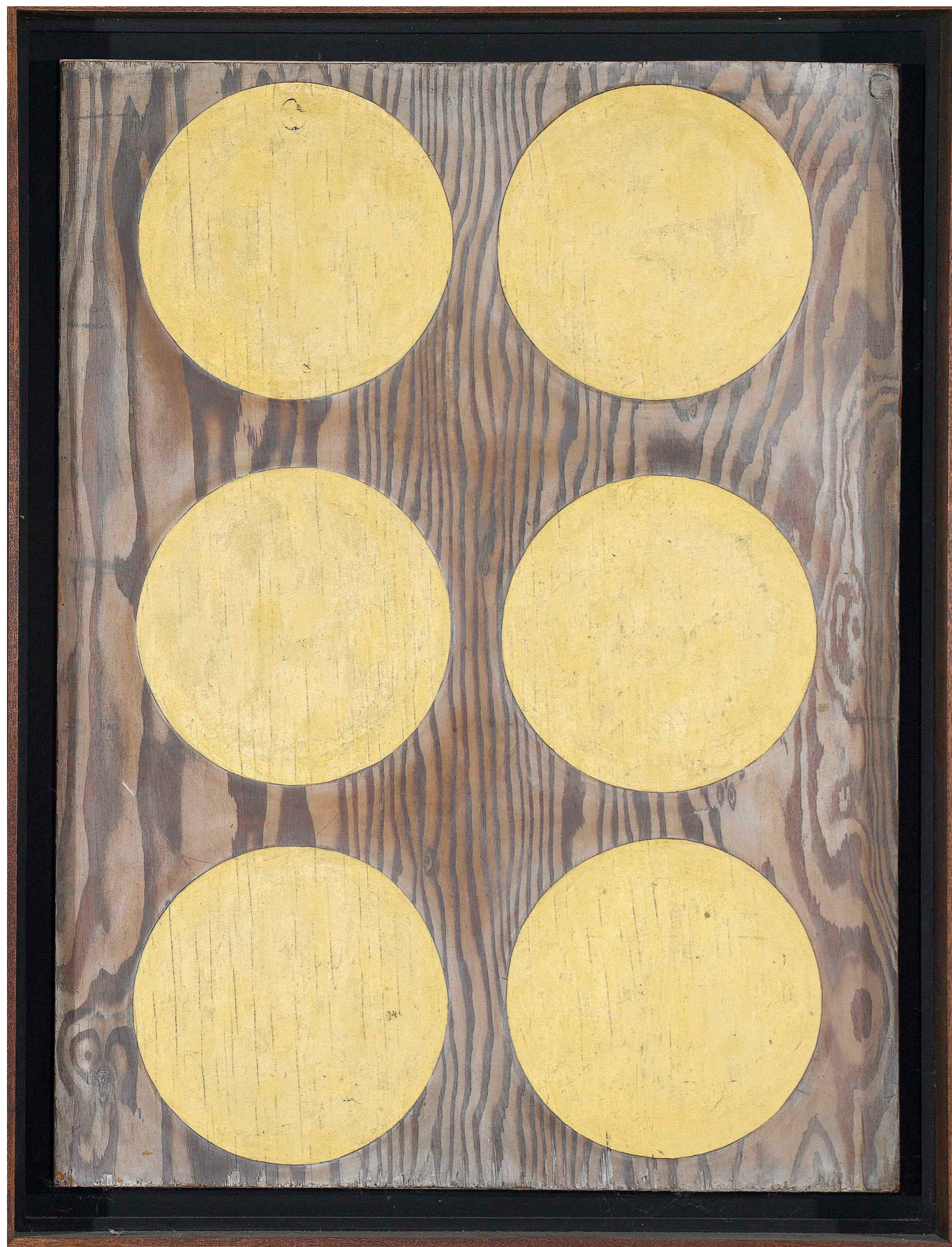
Robert Indiana Sixth State 1959/2001