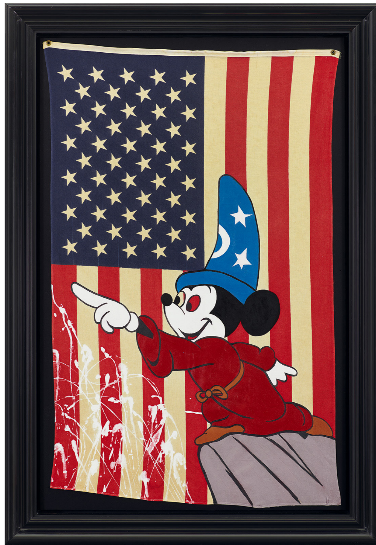
Ronnie Cutrone Sorcerer's Apprentice - Dancing Waters 1985